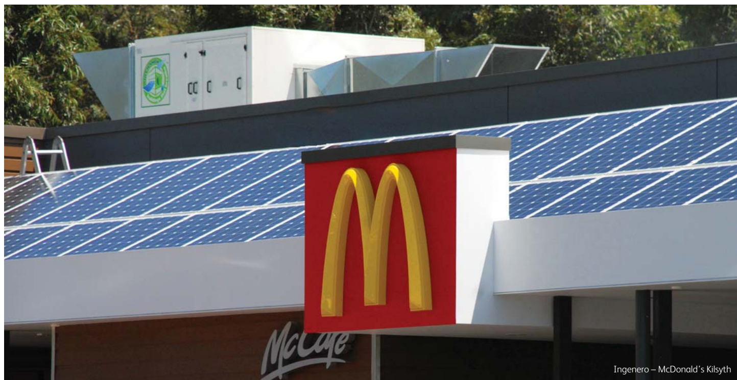
Ingenero – McDonald's Kilsyth

More information of the program is available from AusIndustry ausindustry.gov.au/programs/CleanTechnology/CTFFIP/Pages/default.aspx .