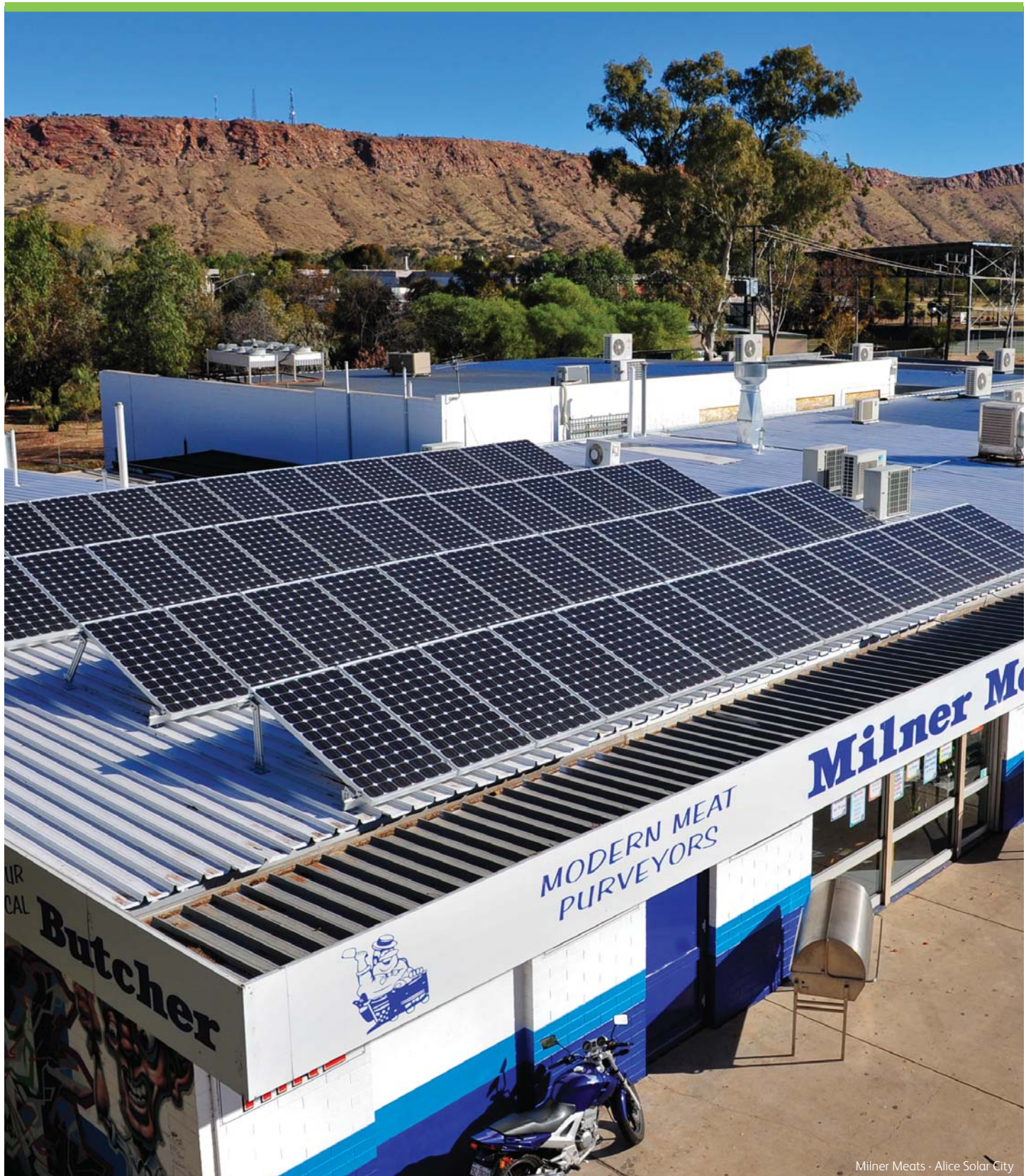
Milner Meats - Alice Solar City